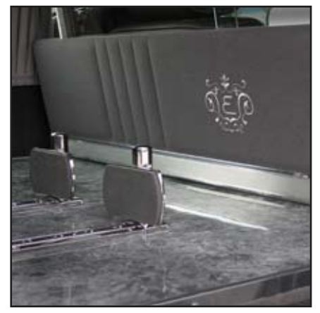
Leather interior in driver's compartment on the base Cadillac chassis is accented by matching cloth and trim in the rear compartment.