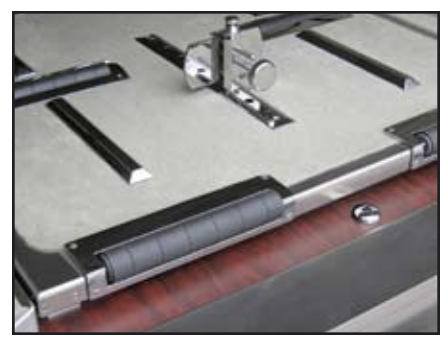
Optional rear compartment carpeting on an optional electric extend table.