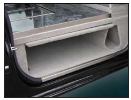
Optional closed church truck well with compartment door.