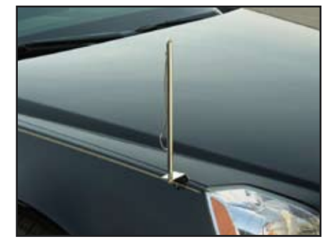
Optional flag staff holder.