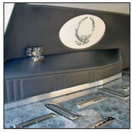
Stylized wheelhouse panels, with brushed aluminum accent moldings, are shaped to yield more floor space to carry additional flowers.