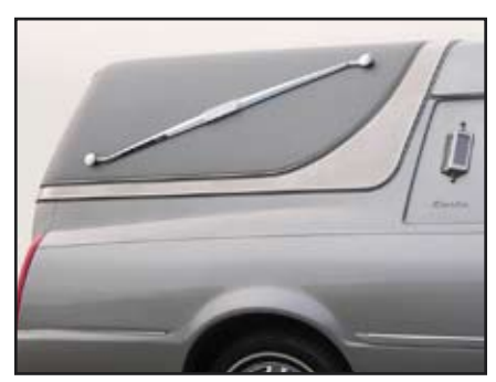
Optional signature chrome band.