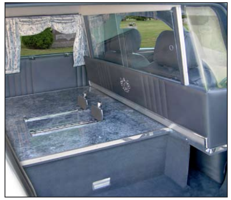
Dual, stationary front bier pins and an open church truck compartment.