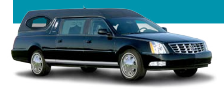
Shown with optional oval rear window and lower chrome molding.