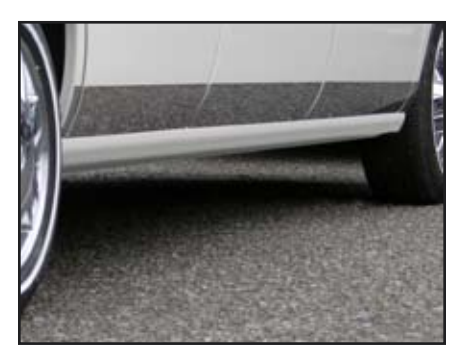
Optional lower chrome molding.