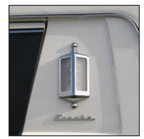
The Eureka name plate and coach light come standard on the Brougham.